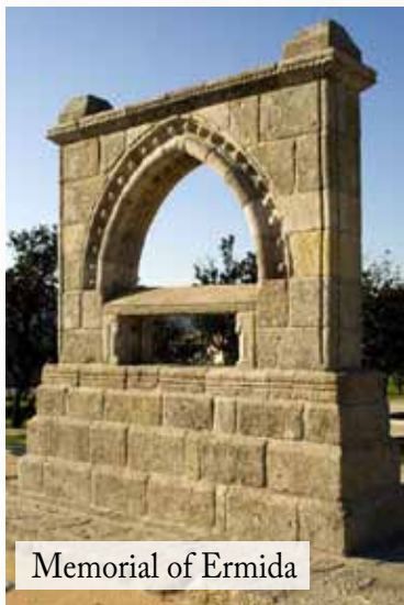
Memorial of Ermida

VALSOUSA - Associação de Municípios do Vale do Sousa Rota do Românico | Route of the Romanesque Praça D. António Meireles, 45 4620-130 Lousada - Portugal GPS: 41°16' 33.72" N / 8°17' 1.54" O Phone: +351 255 810 706 Phone: +351 918 116 488 Fax: +351 255 810 709 E-mail: rotadoromanico@valsousa.pt Web: www.rotadoromanico.com