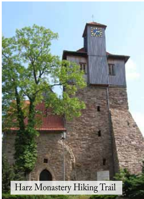
Harz Monastery Hiking Trail

Tourist Information Office of Ilsenburg Marktplatz 1, 38871 Ilsenburg Germany Phone: +49 39452 19433 E-mail: info@ilsenburg.de Web: www.ilsenburg.de