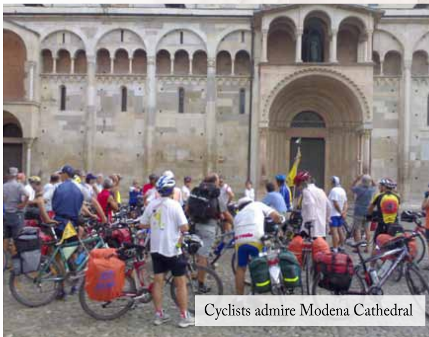
Cyclists admire Modena Cathedral

Info: http://alpregio.outdooractive.com/ar-kaernten/de/alpregio.jsp#tab=ToursTab