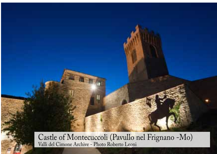
Castle of Montecuccoli (Pavullo nel Frignano -Mo)

Mighty castles and fortresses stand guarding the horizon of the low plain, keeping guard over valleys and water courses amid the gently-rolling hills at the foot of the mountains, dominating over the surrounding countryside from their elevated positions. The province of Modena boasts an extraordinary number of castles, built in different periods to control a territory which has always been a hub of roads criss-crossing the peninsula from north to south, from east to west. And a history packed with events involving kings, feudal lords and communities has resulted in castles being built, later transformed into rich palaces to host some of the most sumptuous courts of the Po Valley Renaissance, alongside huge and gloomy medieval structures, some dating back to the Roman age. Various fortifications were built as a defence against the Magyars in the 10th century, others kept guard over strategic places and old pilgrim roads.