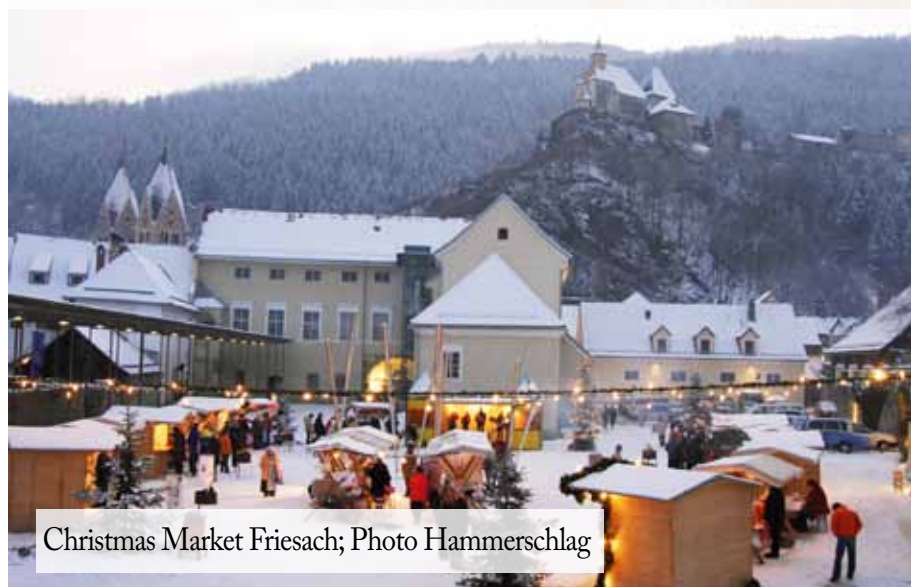
Christmas Market Friesach

Information: Tourist information Friesach E-mail: tourismusinformation@friesach.at Phone: +43 4268 2213 43 Web: www.friesach.at