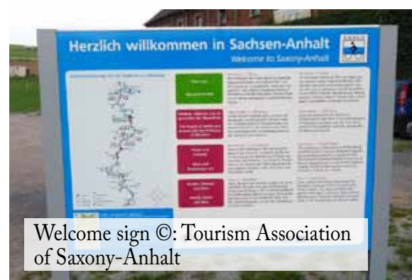
Welcome sign