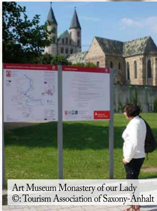
Art Museum Monastery of our Lady

Finally, two of the oldest and most illustrious parish churches of the Modena Apennines: that of S. Silvestro at Fanano, founded towards the valley of the Croce Arcana in 749 A.D. by the Lombard duke S. Anselmo, and the parish church of S. Giovanni Battista at Renno di Pavullo in Frignano, the burial place of the Montecuccoli, the feudal family of Frignano into which was born the famous Raimondo, general of the Empire and military strategist.