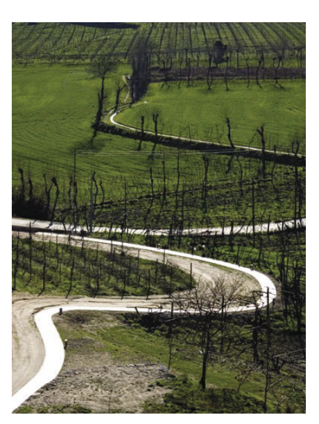
8. The Tower of Vilar is a very expressive element of the way territory was occupied in the Middle Age. To this day, despite all transformations, its location shows how ancient the Sousa Valley's habitat structure is.

The Tower of Vilar is, therefore, a highly esteemed testimony of the existence of domus fortis in the territory of the Sousa Valley. Consecrating a former feudal estate, this very well built and kept Tower is also an excellent example of the quality of the Portuguese medieval architecture with civil function, of the symbolic value evinced by architecture and of the patrimonial landscape of the Portuguese Middle Ages.