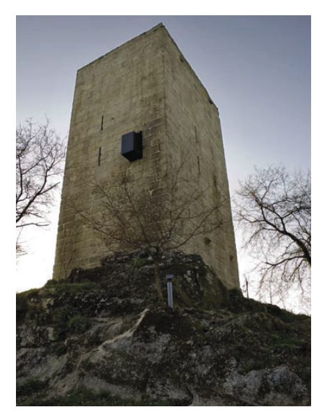
3. The Tower of Vilar rises over a granite layer crowning a

The Tower of Vilar, probably built between the second half of the 13<sup>th</sup> century and the early 14<sup>th</sup> century, is more than a military construction – it is a symbol of lordly power over the territory.