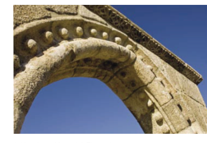
2. Hermitage Memorial. The arch decoration follows the Sousa Valley's Romanesque canon.

The Hermitage is supported by a rectangular stone base, with floor fixing, where the tomb cavity, anthropomorphic according to Abílio Miranda, was opened. The tombstone is half-raised by small adjacent columns bearing briefly etched faces on the exterior sides. The upper finish includes a frieze of beveled leaves sculpted within a technique from the same atelier of masons who worked in the workshop of the Monastery of the Salvador of Paço de Sousa (Penafiel) in the mid 13<sup>th</sup> century. The style featured in the Hermitage Memorial's decoration suggests a dating from around the mid 13<sup>th</sup> century<sup>3</sup>.