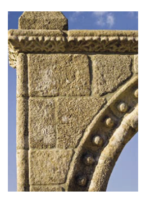
5. Hermitage Memorial. Detail of the construction projection.

The Memorials of Ermida and Sobrado are monuments worth of high esteem, whether for their significance, as for the rareness of specimens remaining in Portugal.