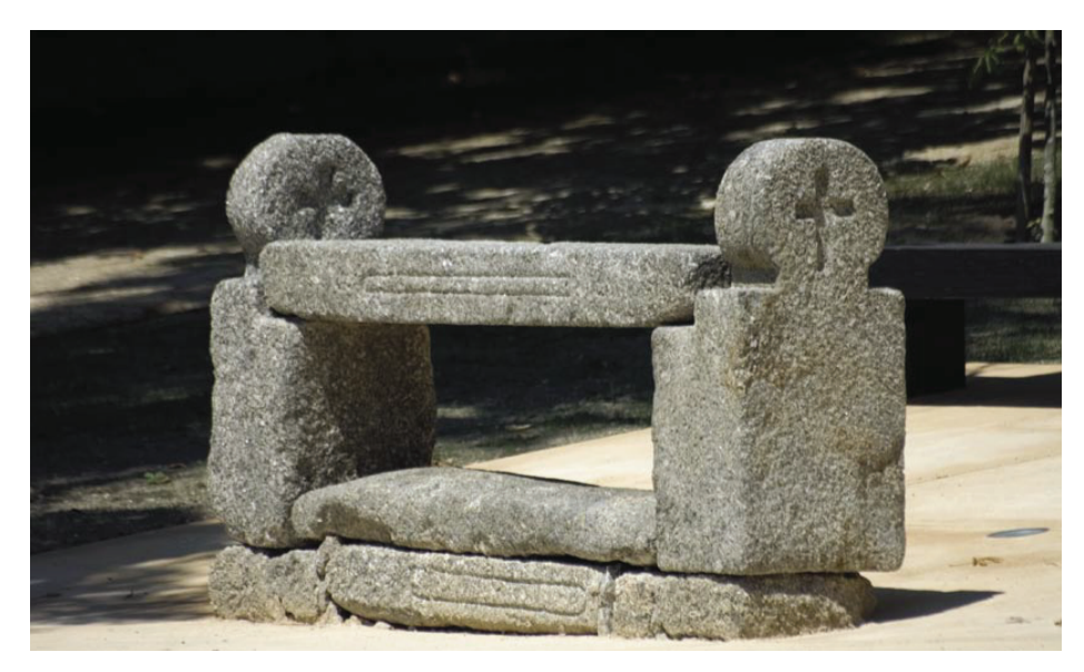
3. The Memorial of Sobrado or Boavista Marmorial (funerary monument) presents a completely different structure from the Hermitage Memorial, since it bears no arch.

Dating this monument is complex due to its peculiar structure facing other memorials, which does not allow inserting it in any specific typology. Nevertheless, the Memorial of Sobrado has been attributed to the mid 13<sup>th</sup> century.