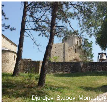
Djurdjevi Stupovi Monastery