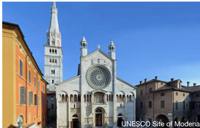
UNESCO Site of Modena

Address: Corso Duomo, 41100 Modena, Italy