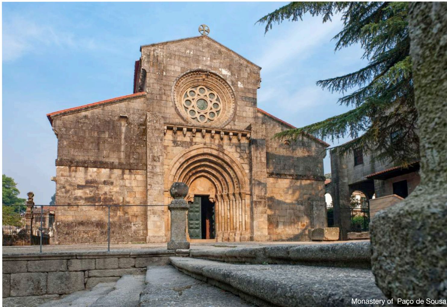
Monastery of Paço de Sousa