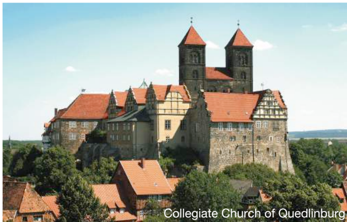
Collegiate Church of Quedlinburg

Address: Schlossberg 1, 06484 Quedlinburg, Germany